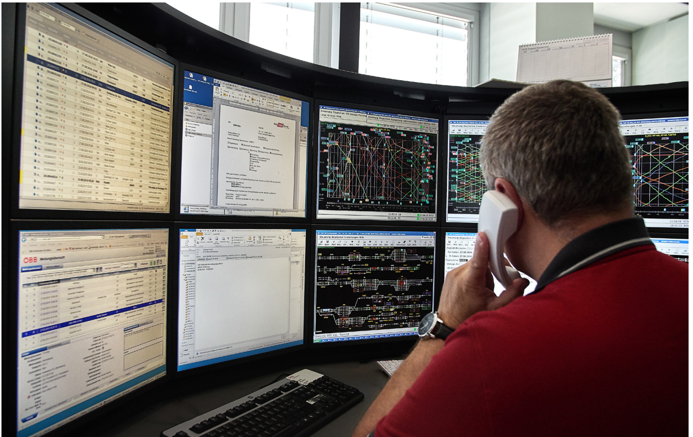
Streamlined: Austrian Federal Railways (ÖBB) uses the Frequentis event management software to coordinate and log information and streamline processes

perspective and optimise strategic planning.